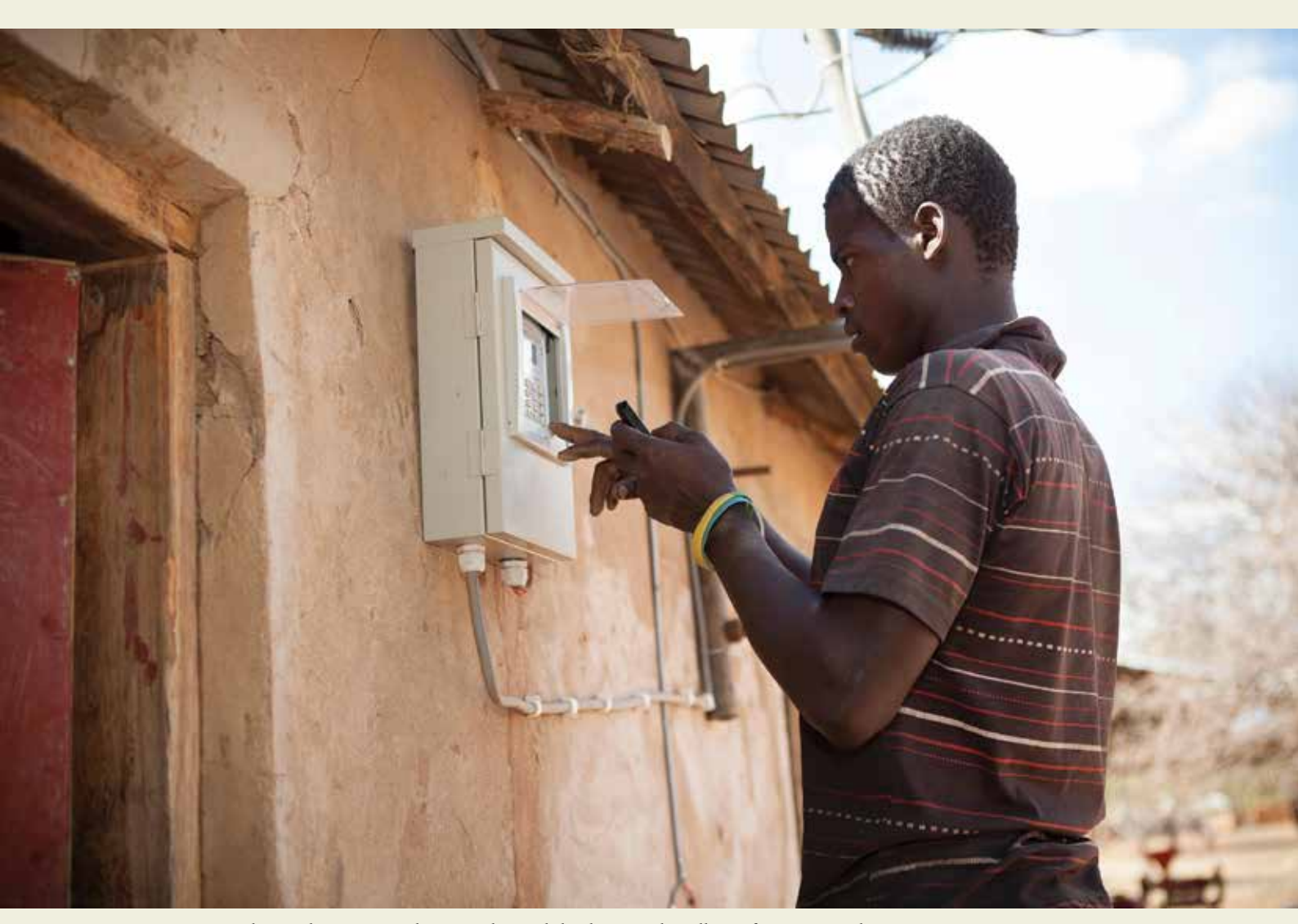
\label{eq:continuous} A \ \text{man purchases electricity credits using his mobile phone in the village of Hogoro, Dodoma Region, Tanzania.}